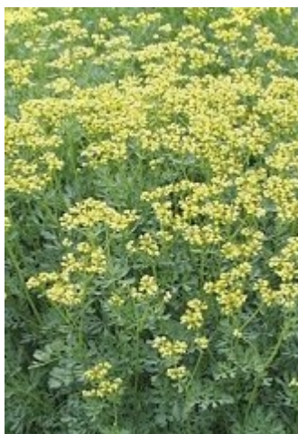
Rue, Herb of Grace

IN THE DESCRIPTIONS NOTE THE VALUE OF SPICES AND WHAT THEY ARE USED FOR. SPICES ARE MENTIONED FREQUENTLY IN SONG OF SOLOMON AS THE CHARACTER GOD BRINGS OUT THROUGH SUFFERING AND INTIMACY WITH HIM.