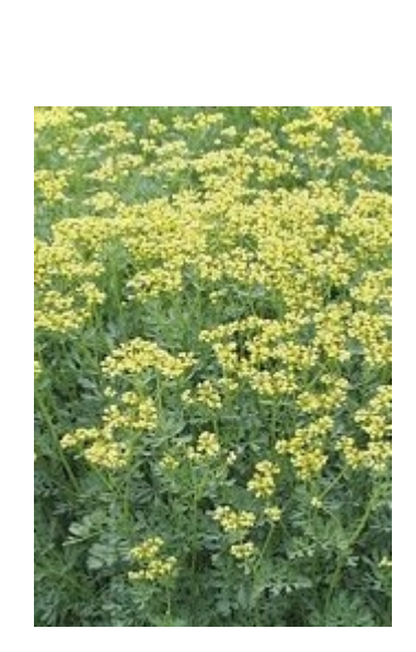
Rue, Herb of Grace

IN THE DESCRIPTIONS NOTE THE VALUE OF SPICES AND WHAT THEY ARE USED FOR. SPICES ARE MENTIONED FREQUENTLY IN SONG OF SOLOMON AS THE CHARACTER GOD BRINGS OUT THROUGH SUFFERING AND INTIMACY WITH HIM.