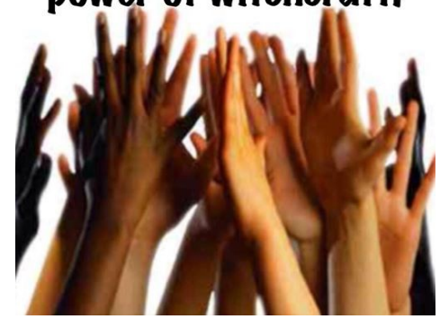
Law and Disorder 7/30/16

Holy Spirit through Priscilla <a href="https://www.upstreamca.org">www.upstreamca.org</a> <a href="https://www.upstream/upstream/upstream">www.upstream/upstream</a>