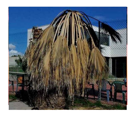
Scarabs 6/30/16 Priscilla Van Sutphin

www.upstreamca.org www.blogtalkradio.com/Upstream