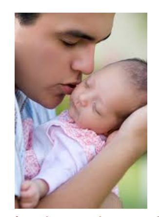
"Muzzled and Muffled" 1/14/16 Thru Priscilla Van Sutphin

thru Priscilla Van Sutphin <a href="https://www.upstreamca.org">www.upstreamca.org</a> <a href="https://www.blogtalkradio.com/Upstream">www.blogtalkradio.com/Upstream</a>