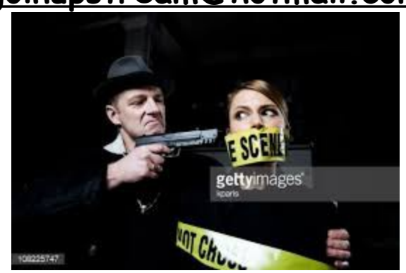
"Stifled & Rifled"

www.upstreamca.org goinupstream@hotmail.com