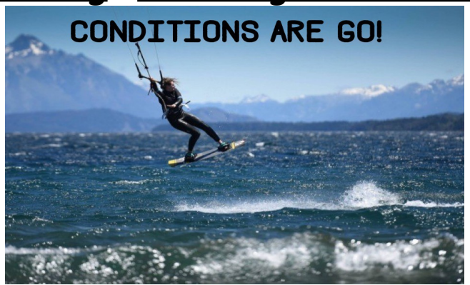
Conditions Are GO!

www.upstreamca.org www.blogtalkradio.com/Upstream