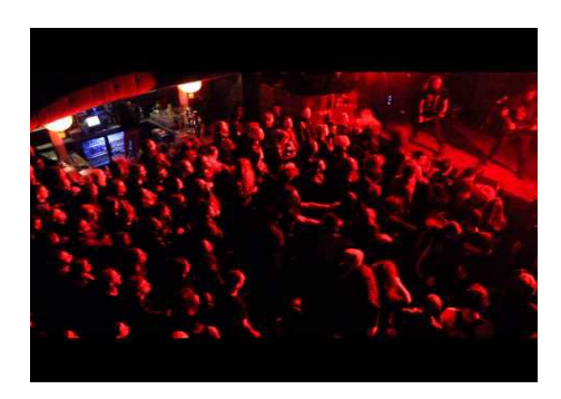
"Concerts to Baal" 6/15/16

www.blogtalkradio.com/Upstream www.upstreamca.org